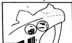
Turn on compressor switch and work flash light switch