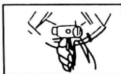
Push down and lock latch