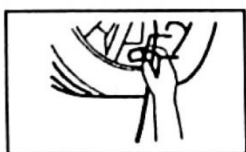
Slip the universal adapter over tire valve

Start car engine and make sure the compressor switch is in the "OFF" position